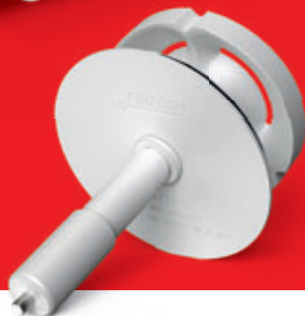
Vario-Lid system with plunger made of plastic PP and reduction sample pusher for moist, liquid and viscous sample materials.

The freely adjustable Vario-Lid system made of plastic PP fulfils two important requirements at the same time: It can be used to reduce the grinding chamber volume down to 0.54 litres and to manually compress and loosen up the sample material at the beginning and at any time during comminution. Thus you always achieve a homogeneous sample in a narrow particle size range even for smaller sample quantities and for difficult-to-grind materials. The Vario-Lid system is delivered as a standard with a reduction sample pusher for moist, liquid and viscous sample materials such as tomatoes, cucumbers or yoghurt. It automatically returns rising liquids during the comminution and can be used for most sample materials. A reduction sample pusher can be ordered as an option for dry, solid samples.