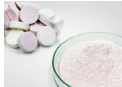
Cookies and vitamin tablets before and after comminution in the Knife Mill PULVERISETTE 11