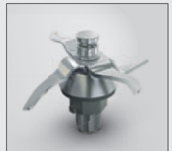
Standard knife with 4 blades