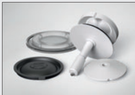
Lids for grinding vessels