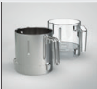
Grinding vessels 1.4 litres