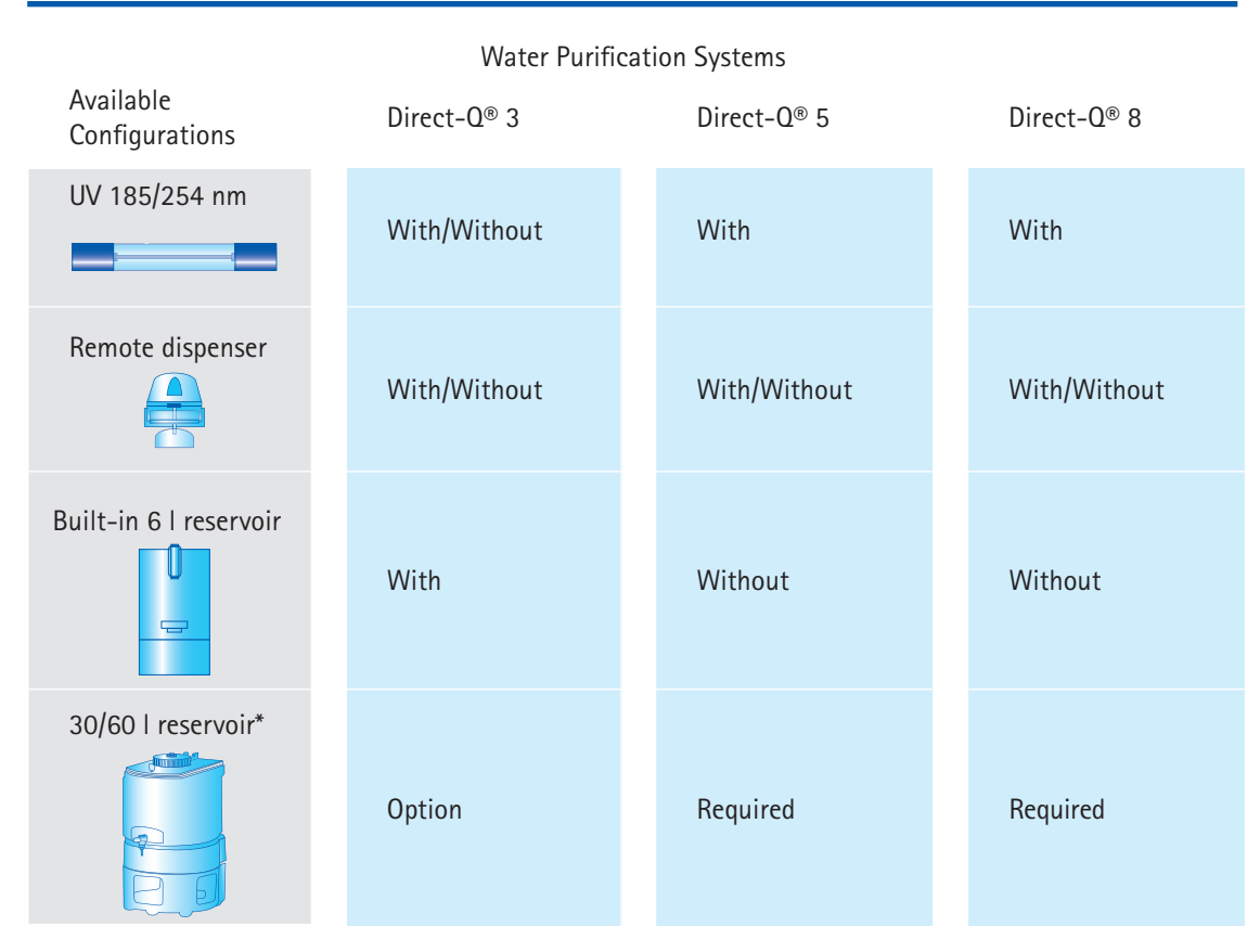
* 30 l or 60 l depending on daily water usage