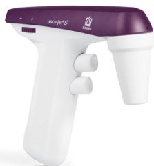
accu-jet® S, berry