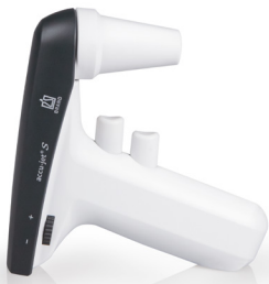
accu-jet® S, anthracite