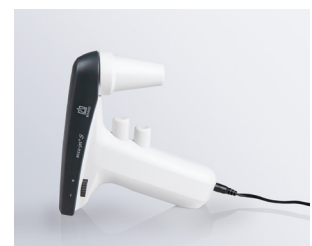
Smart charging technology prevents lazy battery effect