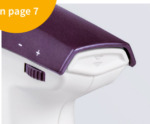
Gravity delivery or blow-out with motor power