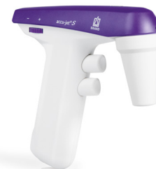
accu-jet® S, amethyst