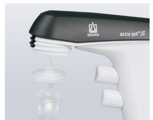
Membrane filter and check valve prevent liquid penetration