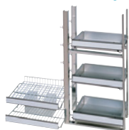
Wire shelves (left), Sliding racks (right)