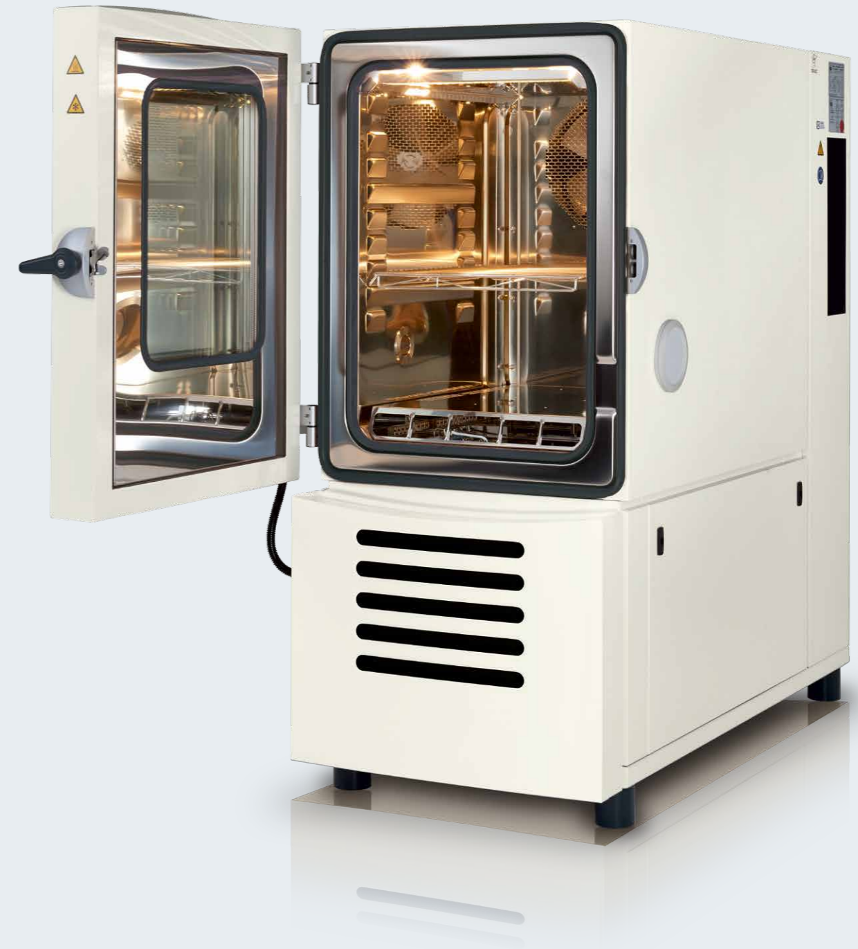
Illustration is similar, contains options

With SIMPATI® software, operating, documenting and archiving your test sequences is very easy.