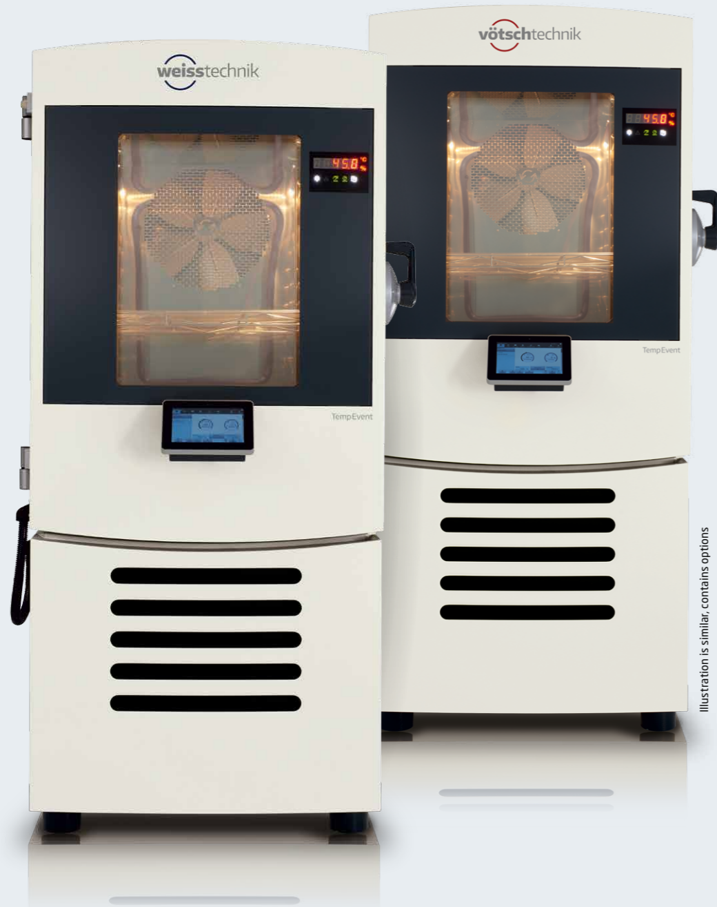
Illustration is similar, contains options

You can find further details on equipment in our technical descriptions. Contact us.