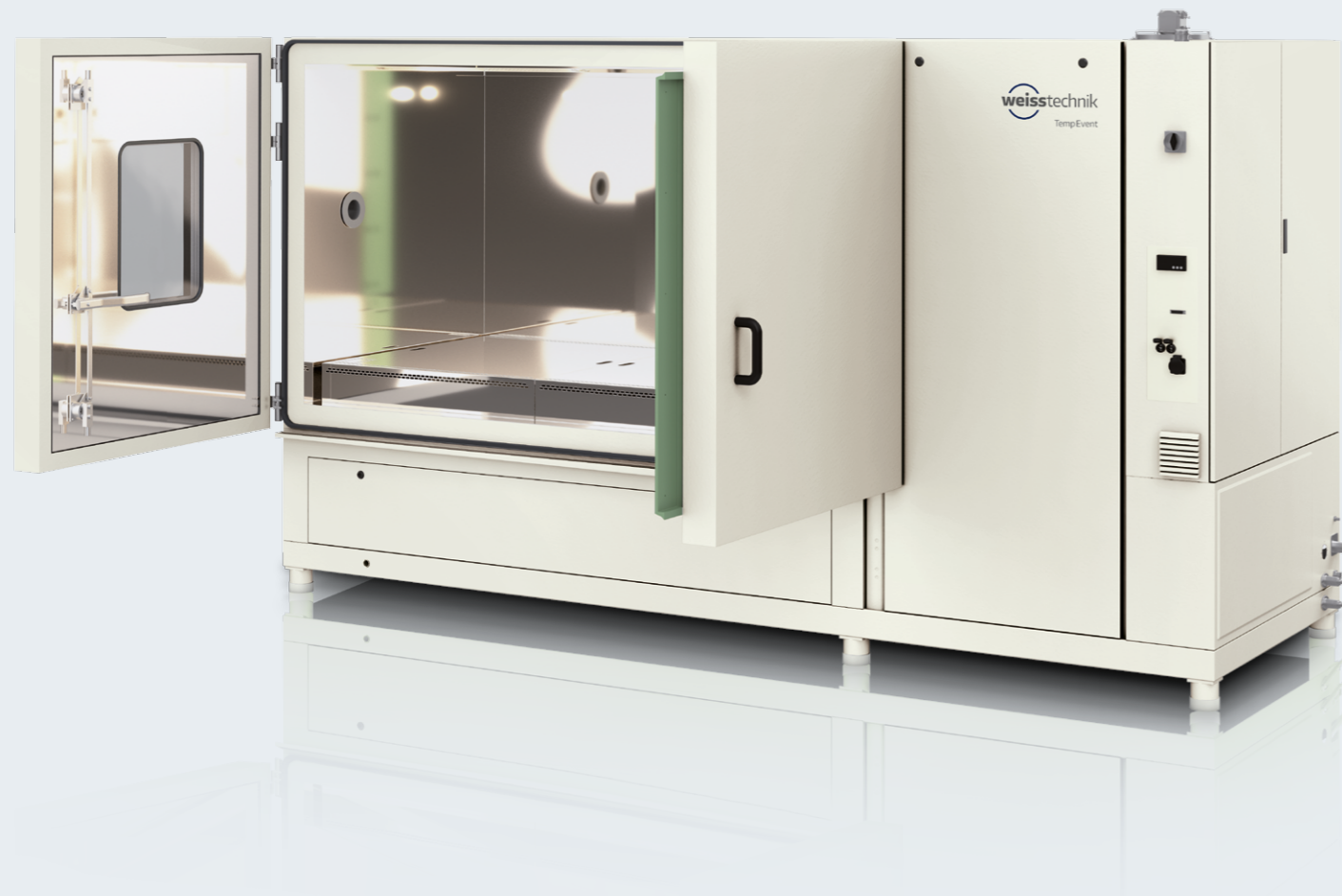
Illustration is similar, contains options

Higher, wider, bigger. Sometimes, it just has to be bigger: in the automotive supply, electrical and electronics industries and in material testing, both large components and complete assemblies are tested. For these tests, we have developed Temperature Test Chambers with test spaces that are extra high - the TempEvent H series - and extra wide - the TempEvent W series - so that your XXL test specimens can easily fit and ease of use is ensured.