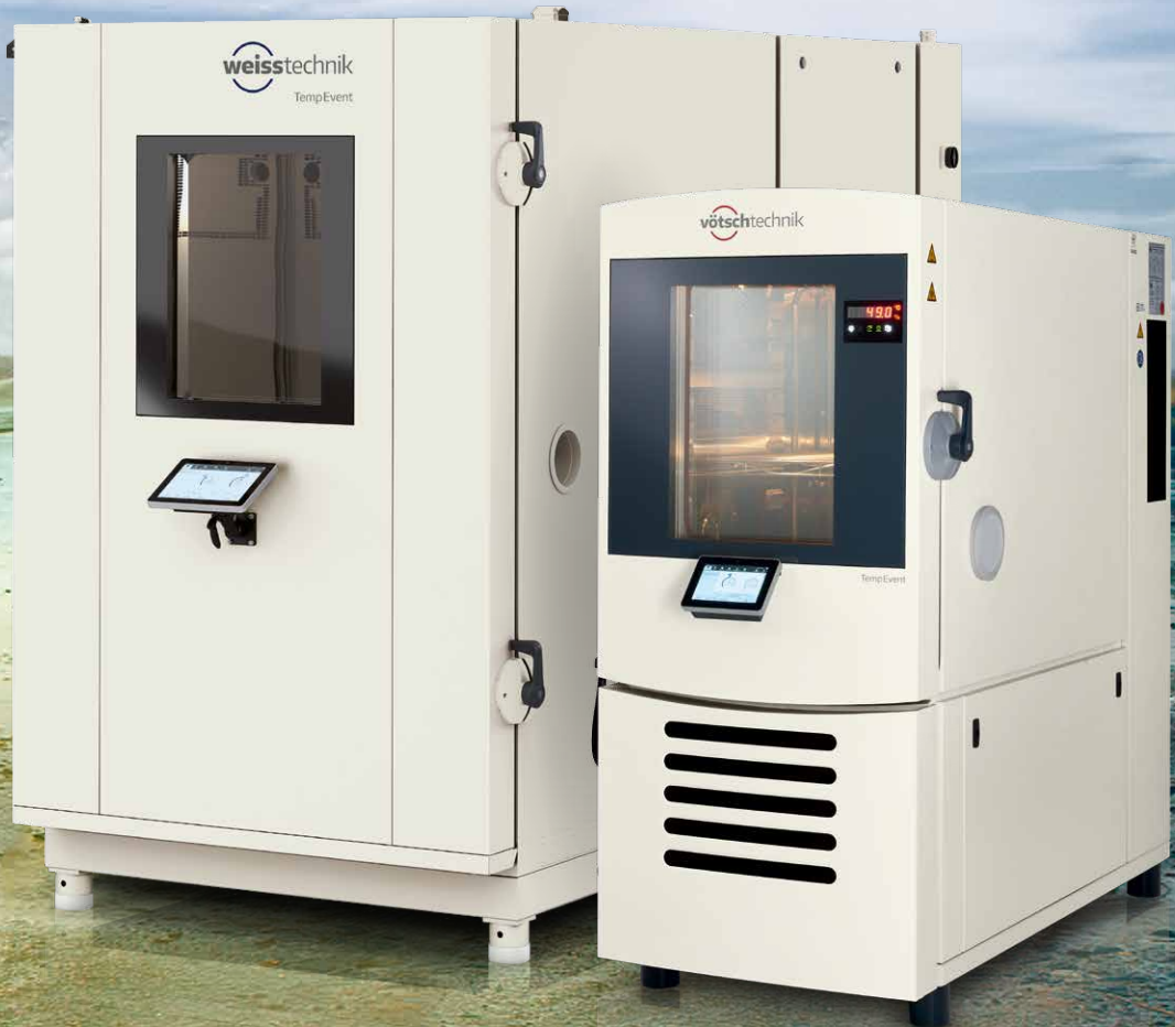
Illustration is similar, contains options