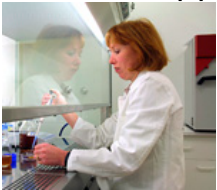
Basic Research / Research Institutes