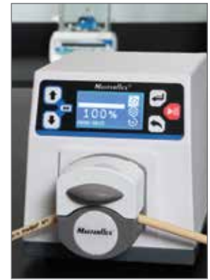
Intuitive, icon-driven interface—copy dispense progress screen shown.