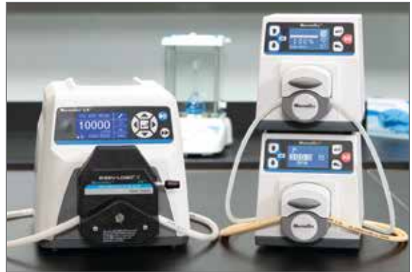
The L/S digital Miniflex pump system (above right) requires less than half the bench space when compared to the L/S standard digital drive (above left).