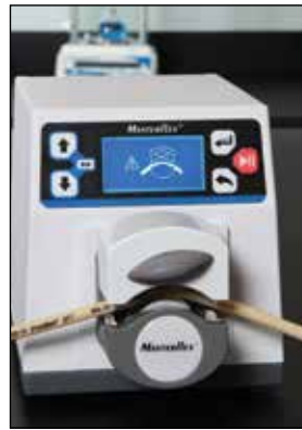
Open-head sensor stops the drive when pump head is open.