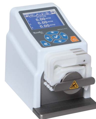
Benchtop model MFLX78001-70

Use the Reglo ICC pump to control up to four channels, each with independent functionality—start, stop, dispense, reverse, aspirate, and calibrate. Time-based routines allow for complex experiment development. Select from benchtop or panel-mount models.